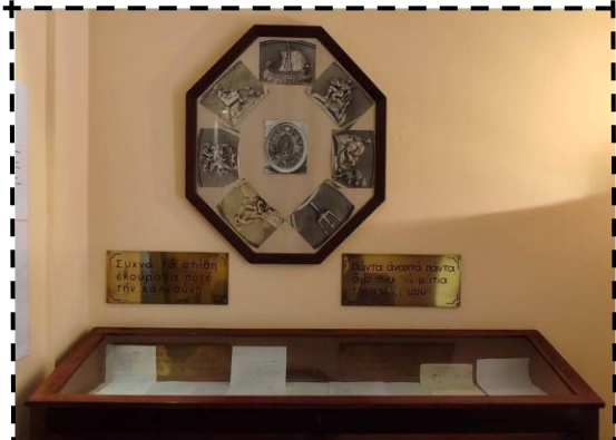
Dionysios Solomos' manuscripts