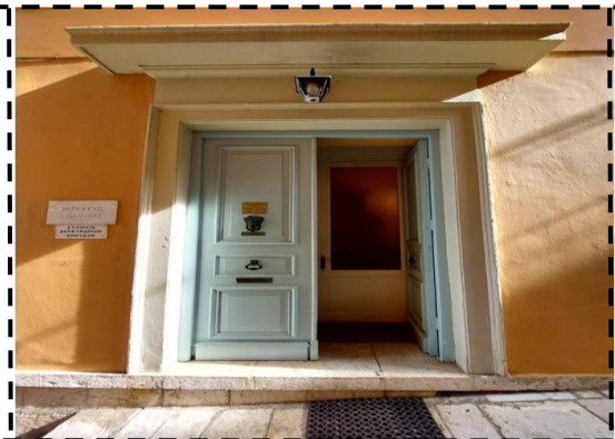
Museum's main entrance