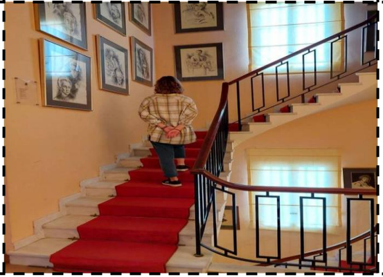
Several portraits of people