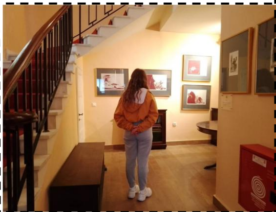
Exhibits of the story "The Woman of Zakynthos"