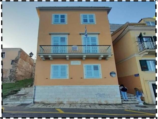
The road towards the museum