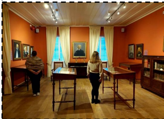
Important items of Dionysios Solomos