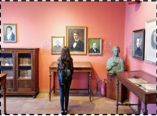
Solomos' manuscripts and books