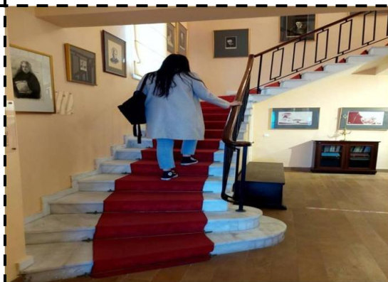
The stairs that lead to the first floor