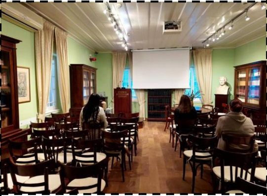
Museum's event hall