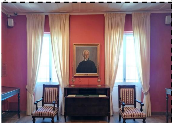
The desk and portrait of Dionysios Solomos