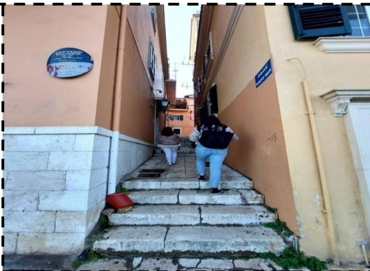
The stairs that lead to the museum