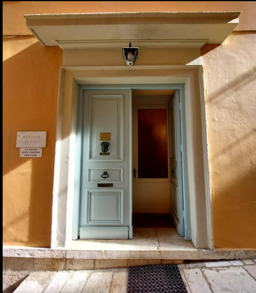
This is the entrance of the museum.