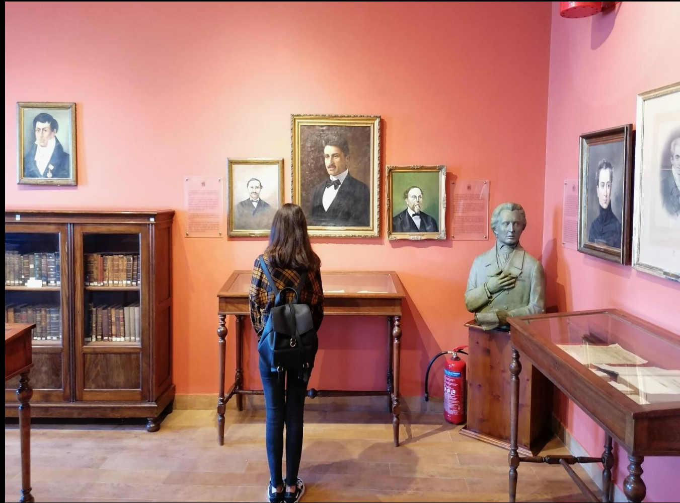
Here I see Solomos' manuscripts and books.